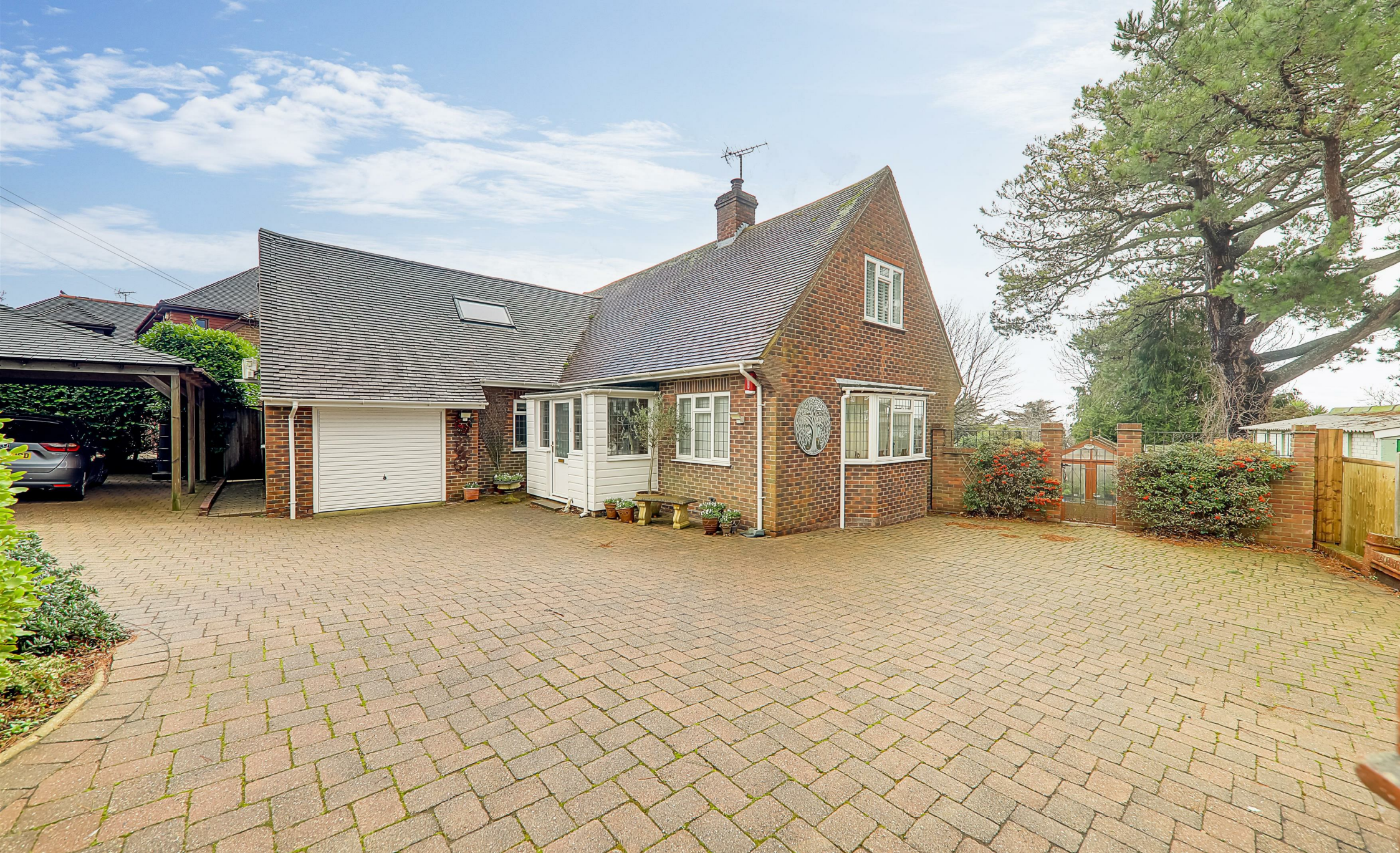
13 Broadview Gardens, High Salvington, Worthing, BN13 3DZ Guide Price £825,000